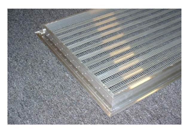
Miter Cut Louvers - Rain Lip on Riveted Blades

Louver is 2.0" in depth with a 1-1/4" front mounting flange